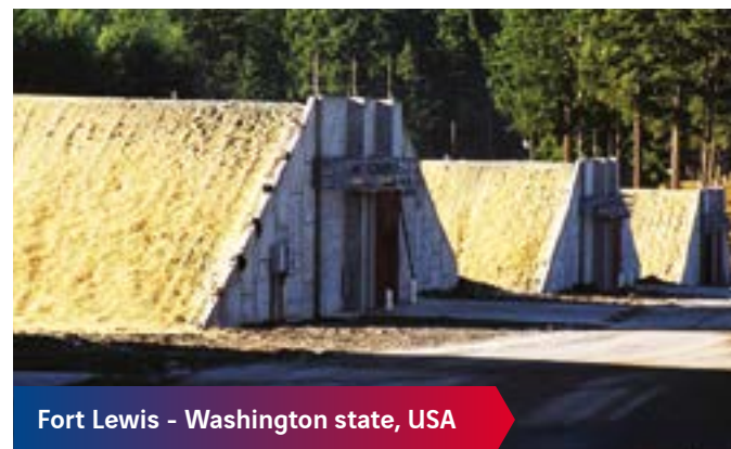
Fort Lewis - Washington state, USA