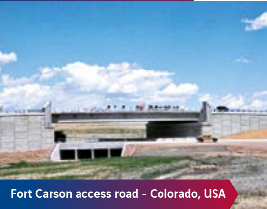
Fort Carson access road - Colorado, USA

Reinforced Earth® structures have become one of the standards for supporting roads, with tens of thousands of structures meeting the requirements and specifications of the world's road authorities. TechSpan® tailored precast concrete arches are a durable system capable of withstanding extreme loads. It can be delivered to remote locations around the world. Reinforced Earth® abutment walls can be designed to accomodate abutment on piles or spread footings. Either systems can be erected in a short window of time with limited or no disruption to traffic flow.