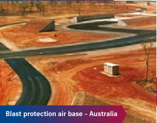
Blast protection air base - Australia

Reinforced Earth® has proven to be a highly stable explosion barrier that impedes the propagation of a blast at ground level and absorbs high levels of energy due to its tolerance for deformation. Moreover, our structures minimize the dispersal of debris during an explosion. Dimensions of the structures can be customized for the asset to be protected.