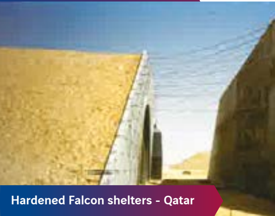
Hardened Falcon shelters - Qatar

Reinforced Earth® ammunition storage facilities and explosives magazines have been built worldwide. Our structures are fully tested and proven in a series of full-scale explosion and blast tests. They comply with the highest standards.