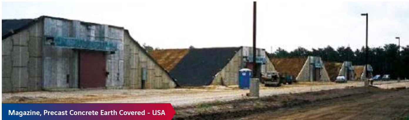
Magazine, Precast Concrete Earth Covered - USA