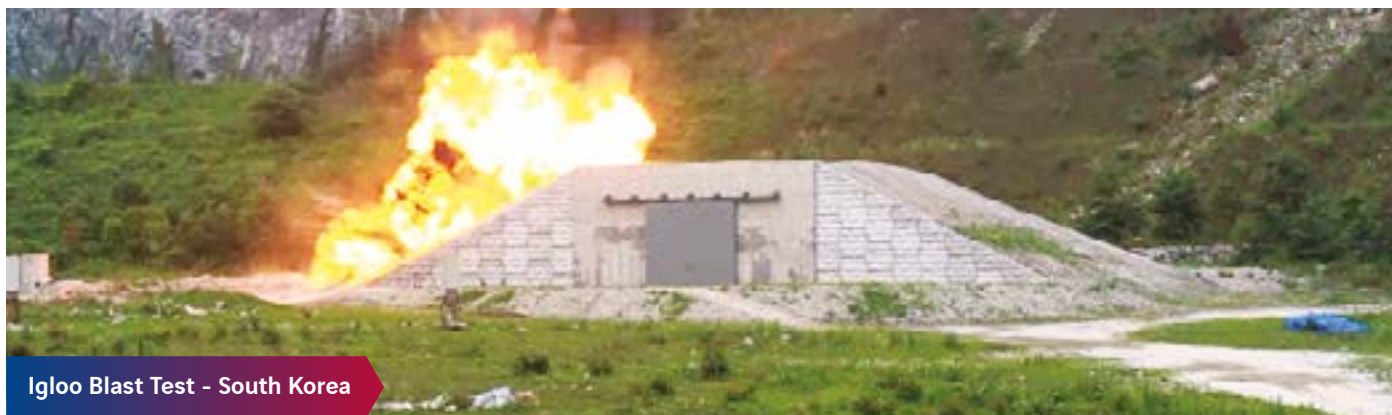
Igloo Blast Test - South Korea