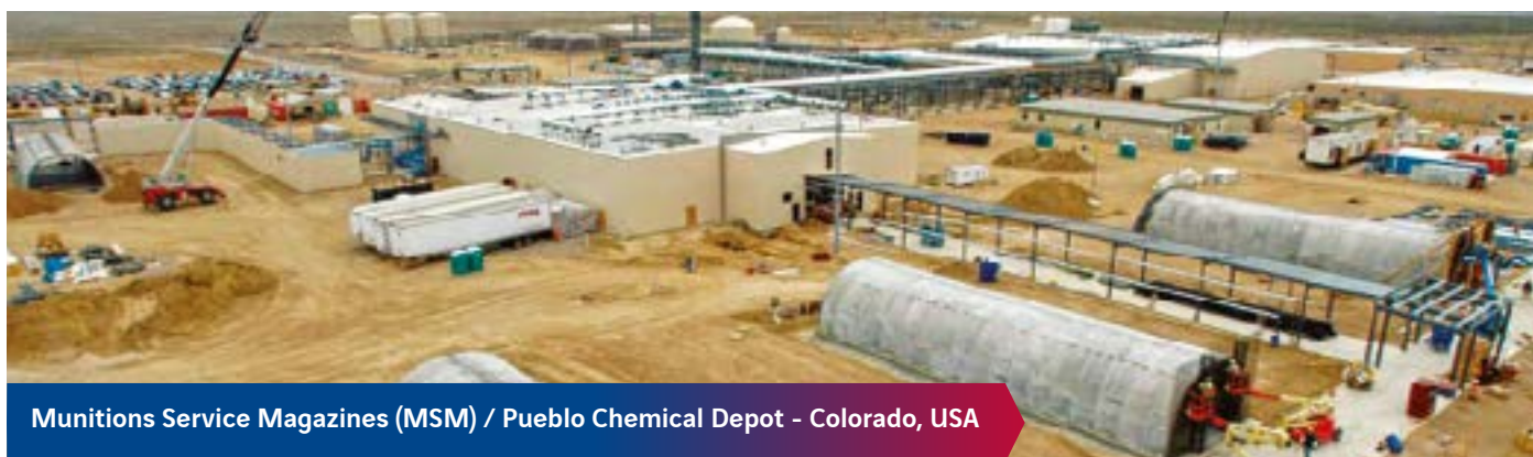
Munitions Service Magazines (MSM) / Pueblo Chemical Depot - Colorado, USA

Engineering expertise, innovation and excellence in client care to deliver sustainable solutions.