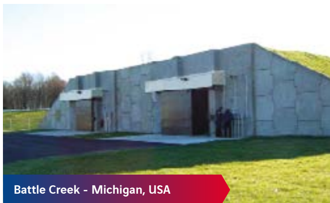
Battle Creek - Michigan, USA